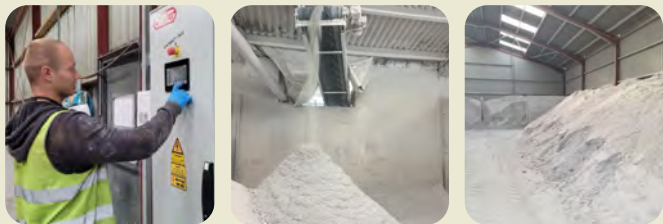
EnviroBed products are made at state-of-the-art renewable heat facilities in Lancashire and Gloucestershire